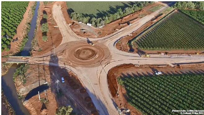
Photo: New roundabout along Old Willbriggie Road.

For further information phone Murrumbidgee Irrigation on (02) 6962 0200.