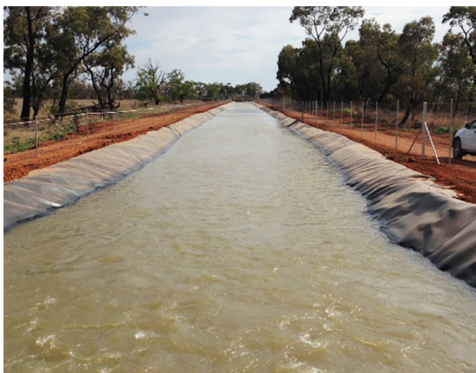
Lateral 258 in Warburn will be lined with high-density polyethylene (HDPE) like the channel in this photo.